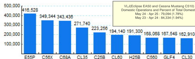
5.Top Ten Aircraft for Domestic Business Jet Operations May 24 - Apr 25

* - Year to date Source: ETMSC Note: International flights include US to Foreign, Foreign to US and all foreign operations.