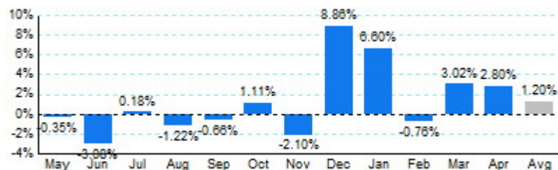
2.Year Over Year Change in Business Jet Operations May 24 - Apr 25 vs. May 23 - Apr 24

Source: ETMSC Note: Operations refer to arrivals and departures.